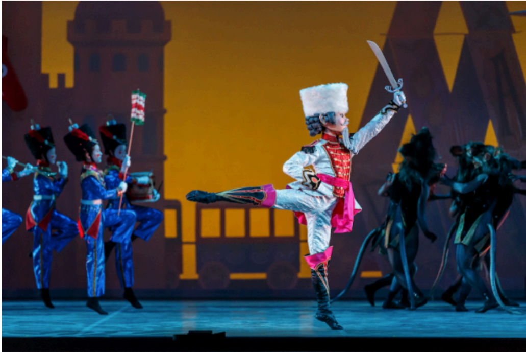
Ballet Austin's The Nutcracker, now in its 55th year, is a favorite holiday tradition for Central Texas families.

SAVE 20 PERCENT on tickets to Ballet Austin's annual production of The Nutcracker presented by the Georgia B. Lucas Foundation Fund, when you also purchase tickets to Not Afraid of the Dark--The Show that Glows! ® This hour-long production is a great way to introduce young children to the ballet in a colorful, glow-in-the-dark environment that's as fun to share as a bedtime story!