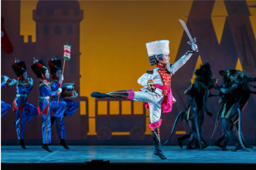
Ballet Austin's The Nutcracker, now in its 55th year, is a favorite holiday tradition for Central Texas families.