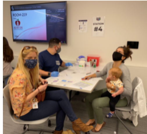
Working at the AISD/Code4 Covid Vaccine Clinic