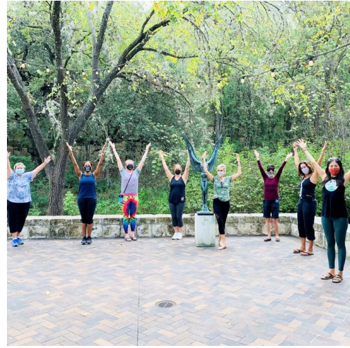
ACL Live Tour Sculpture Garden