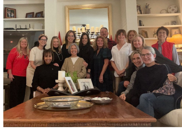
President's Holiday Open House