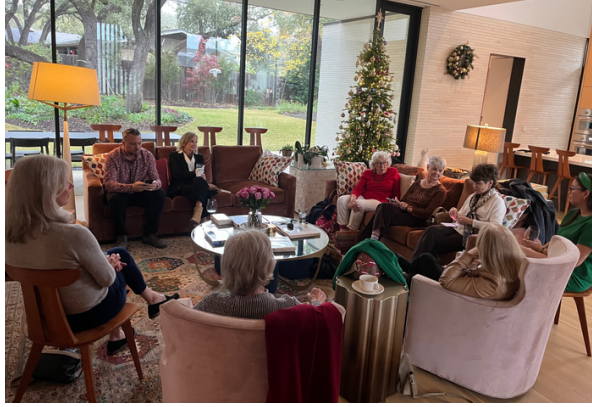
Book Review Club Holiday Event