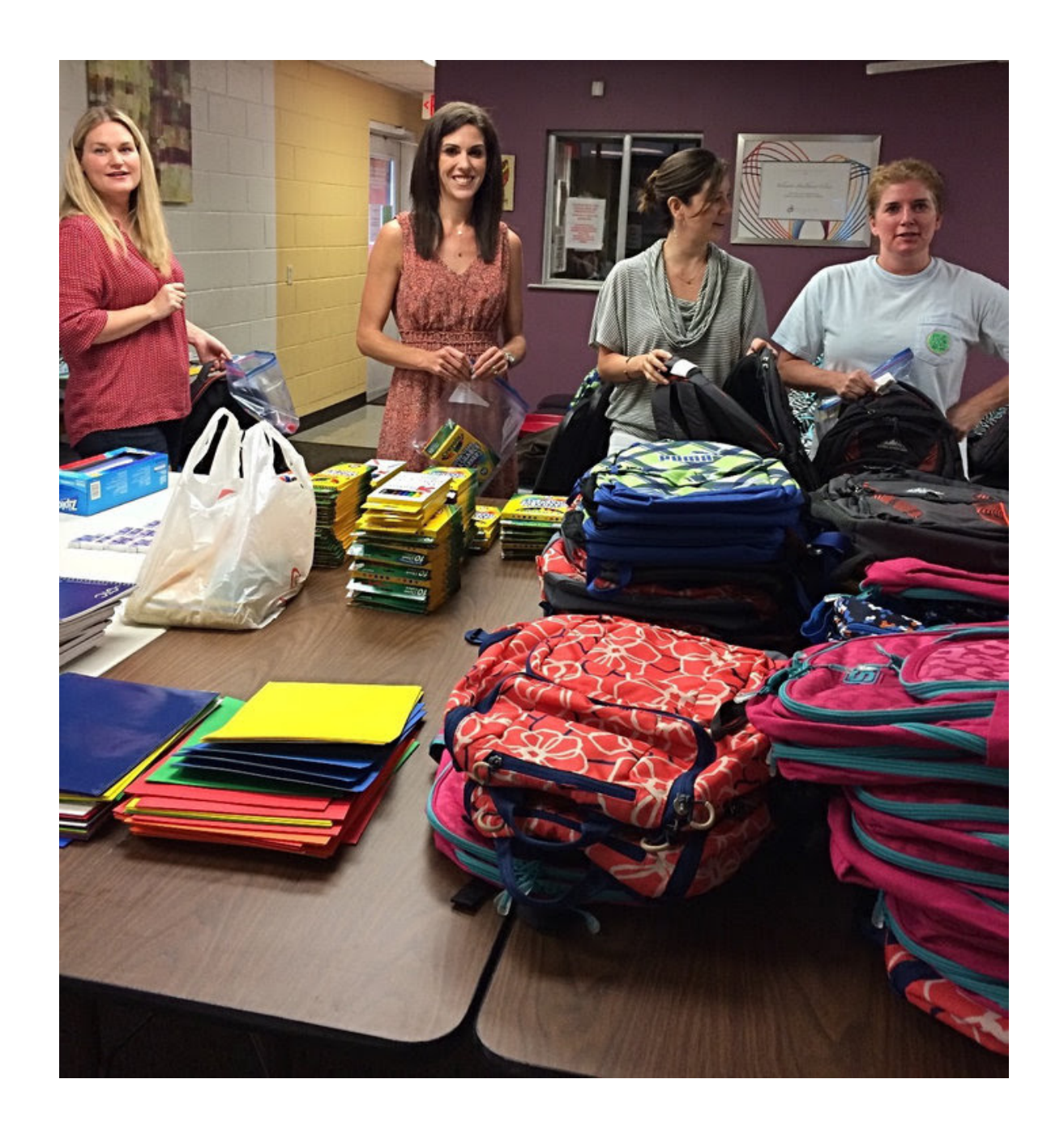
This past week Alliance members stuffed 50 backpacks with school supplies to be distributed to children served by the Volunteer Healthcare Clinic.